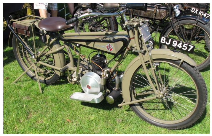
This is a PV from this London-based company operating 1910-25. They fitted various bought-in engines into their sprung frame, and this looks like a 247 cc Villiers in an early 1920s machine.