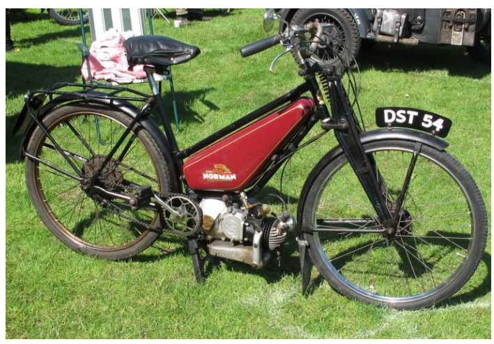
And here is a once-common 1950s Norman, with this 1937-61 company making many similar autocycles equipped with a 98 cc Villiers engine.