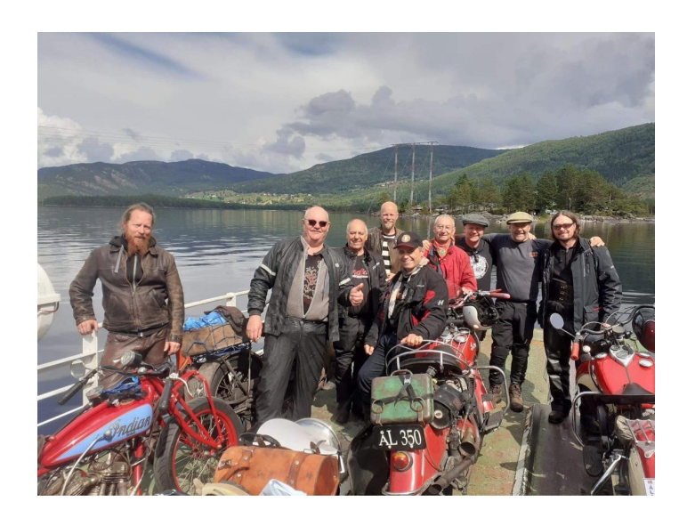
It also rained during the ride-out as we can see: