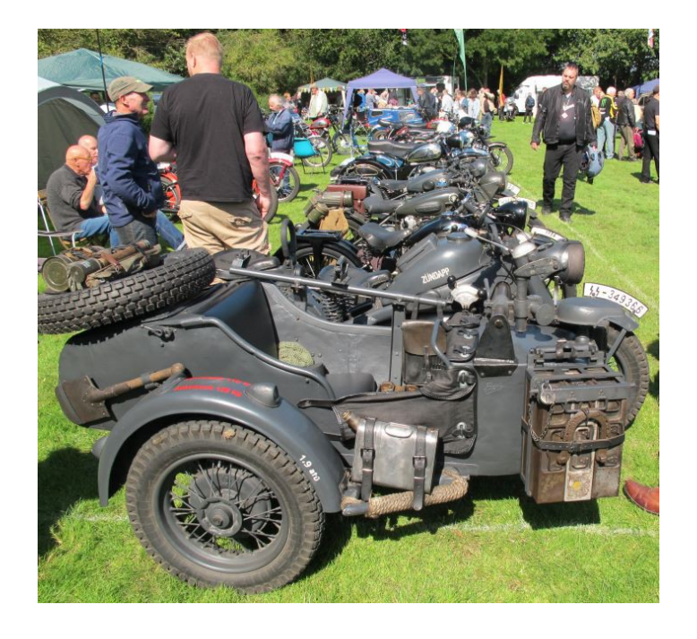
There were similar display from the Velocette Club, Ariel, BSA, Japanese, Indian Clubs and so on, plus a swap meet. I saw again the 1897 Leon-Bollee from the Pioneer Run, plus these two unusual items: