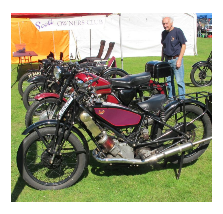
The German military motorcycles put on this line-up, with a Zundapp sidecar outfit at the front: