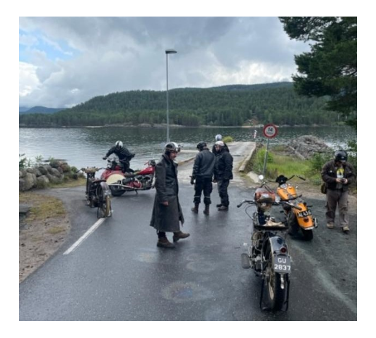
But great scenery of trees and lakes, with winding roads for these old bikes to negotiate.