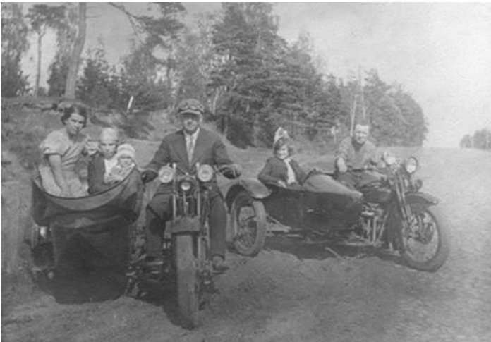
After studying notes and the front fender bracket design it turned out that my model is from 1929, could be one of the last De Luxe models produced.