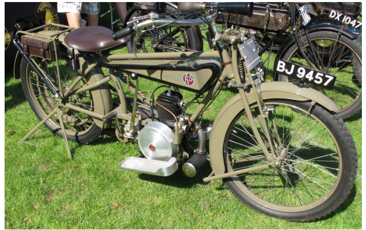
This is a PV from this London-based company operating 1910-25. They fitted various bought-in engines into their sprung frame, and this looks like a 247 cc Villiers in an early 1920s machine.