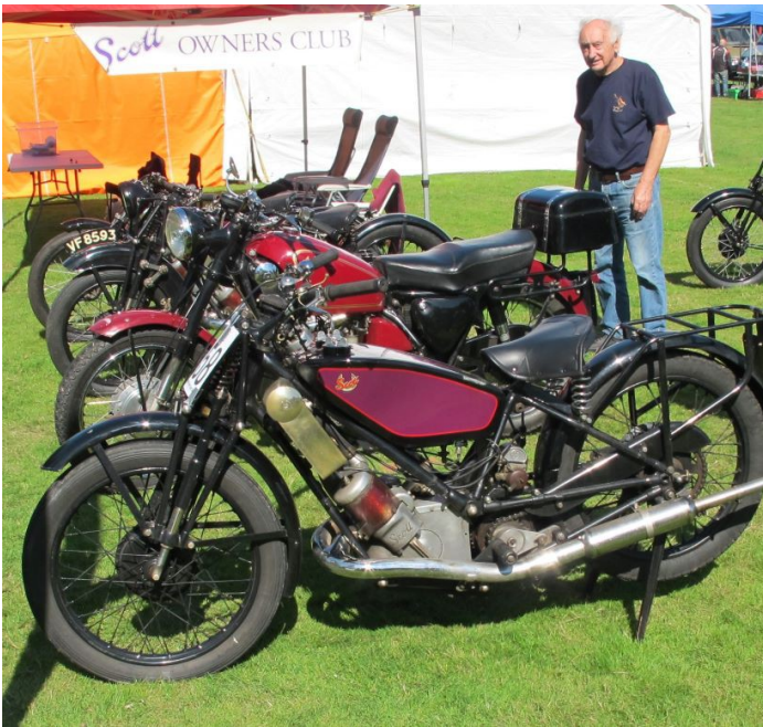
The German military motorcycles put on this line-up, with a Zundapp sidecar outfit at the front: