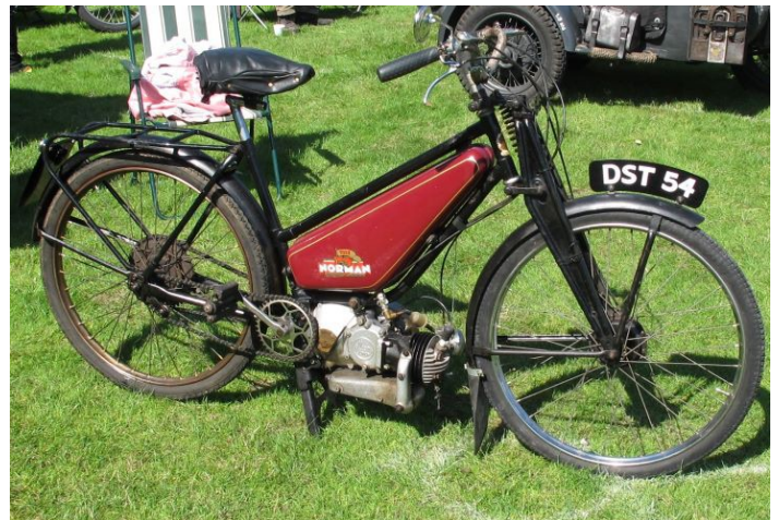
And here is a once-common 1950s Norman, with this 1937-61 company making many similar autocycles equipped with a 98 cc Villiers engine.