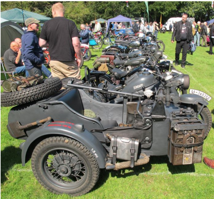
There were similar display from the Velocette Club, Ariel, BSA, Japanese, Indian Clubs and so on, plus a swap meet. I saw again the 1897 Leon-Bollee from the Pioneer Run, plus these two unusual items: