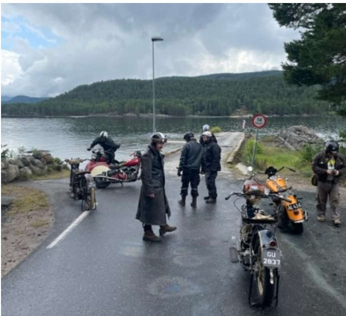
But great scenery of trees and lakes, with winding roads for these old bikes to negotiate.