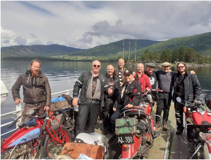
It also rained during the ride-out as we can see: