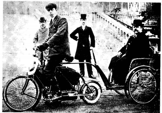
HOLDEN 1901 1hp 3 HP a quatre cylindres refroidissement d'air

The bike is an 800 cc flat four, with a double acting cylinder either side and direct drive to the small rear wheel. It developed around 3 hp at 300 rpm, giving a top speed of about 17 mph. There are no fins on the cylinders and the early versions suffered from seizures, so later machines were water cooled. Here is such a machine in 1901, with the smartly dressed gent enjoying a ride in the towed wicker sidecar: